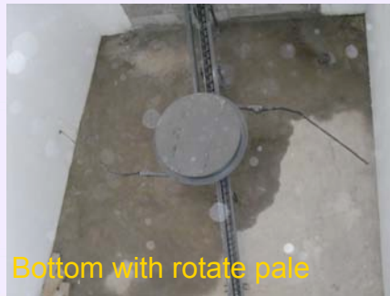
Bottom with rotate pale

Example : NEXITY : One single Wood boiler with power modulation Type : Volcano 140-540 kW (KOB-PYROT)